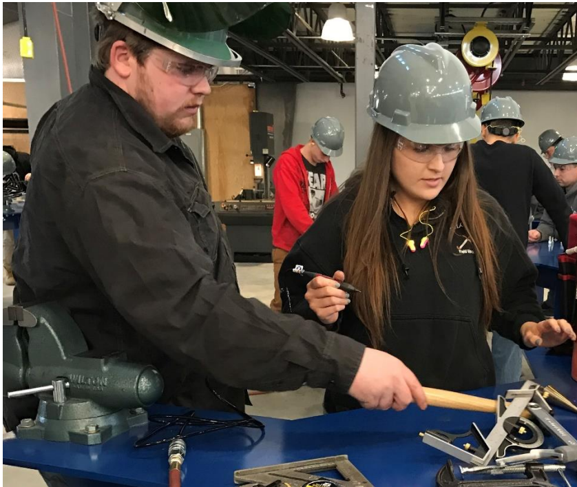
Maritime pipefitting lab for Electric Boat trainees