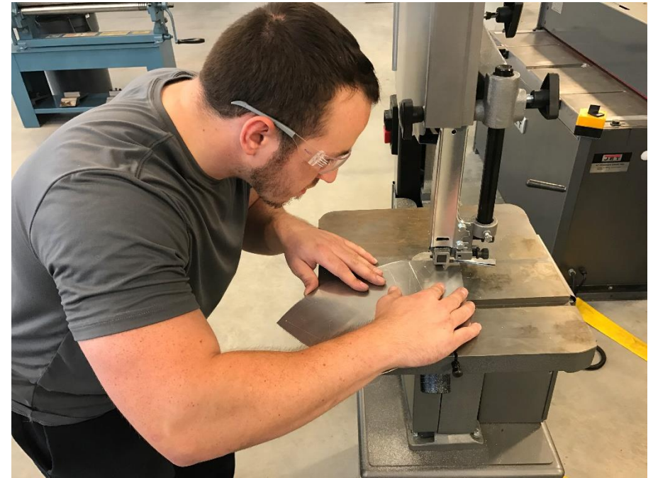
Power equipment in the sheet metal area