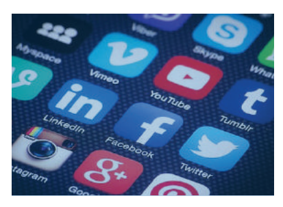
INDUSTRY PROJECTS SUCH AS CREATING A SOCIAL MEDIA CAMPAIGN