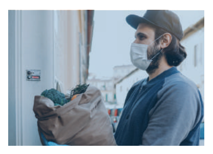
SERVICE-LEARNING PROJECT: DEVELOP A PUBLIC HEALTH INFORMATION CAMPAIGN